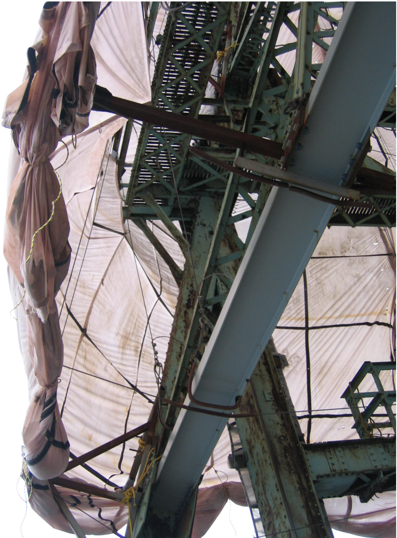
Tower Containment & Out Rigger Brackets