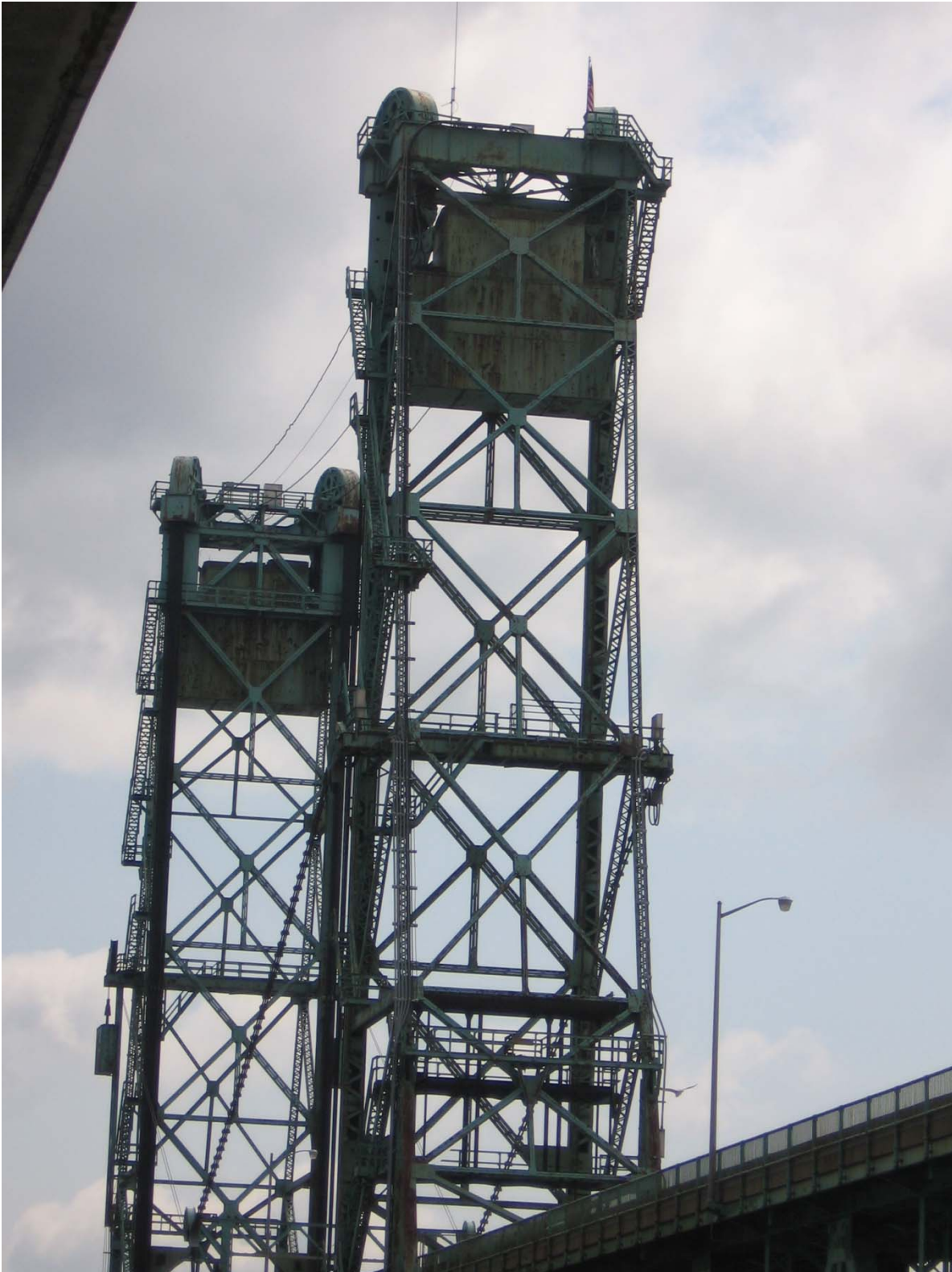
Carlton Lift Bridge

PROJECT DESCRIPTION: Steel Repairs & Blasting & Painting Project