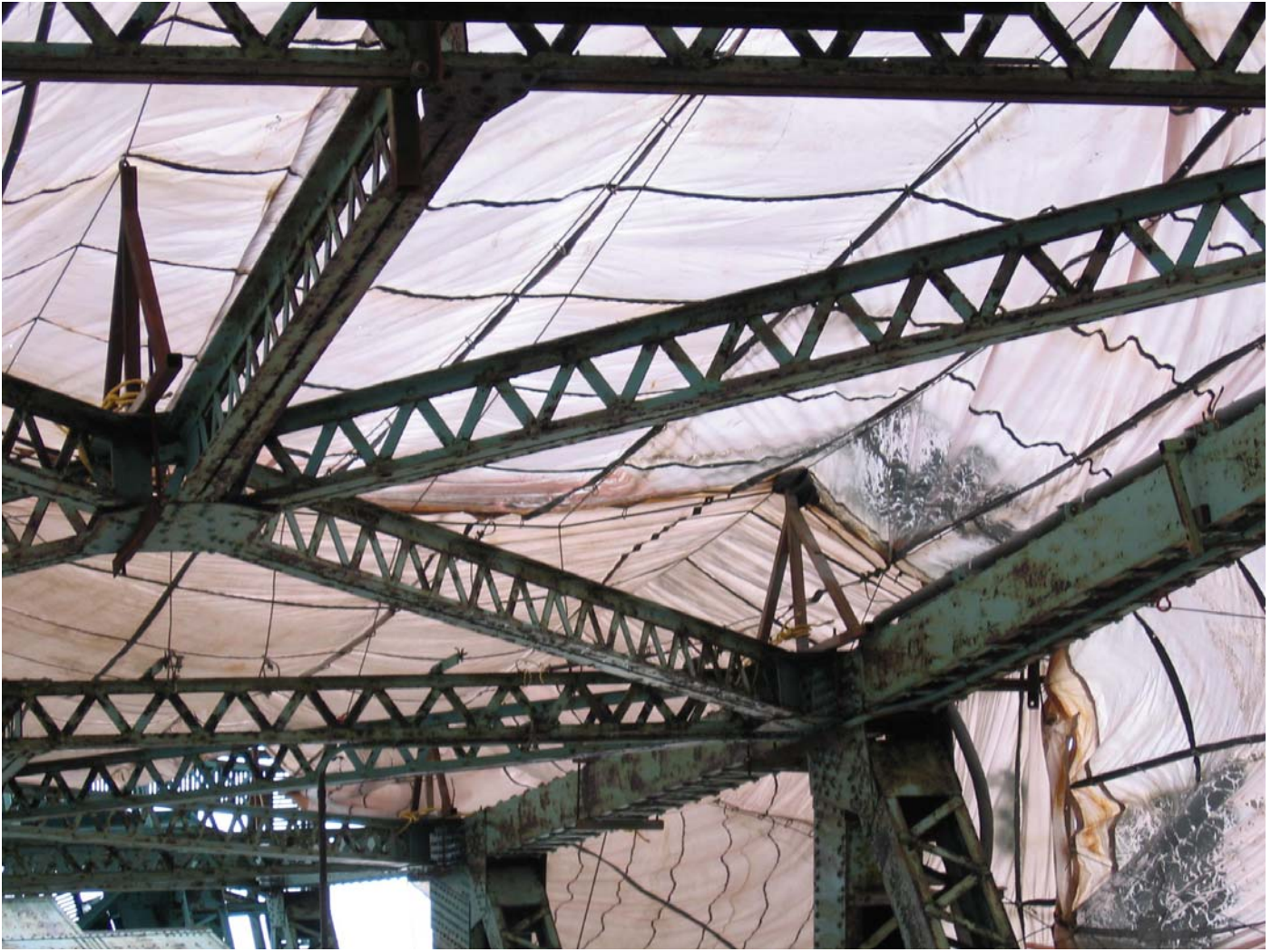
Tower Containment Looking Down