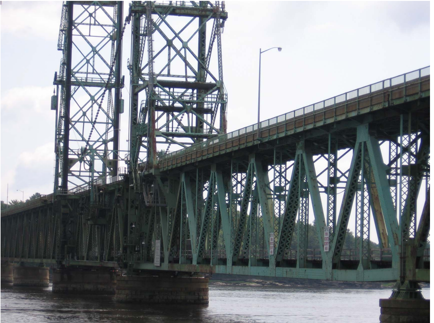
Carlton Lift Bridge